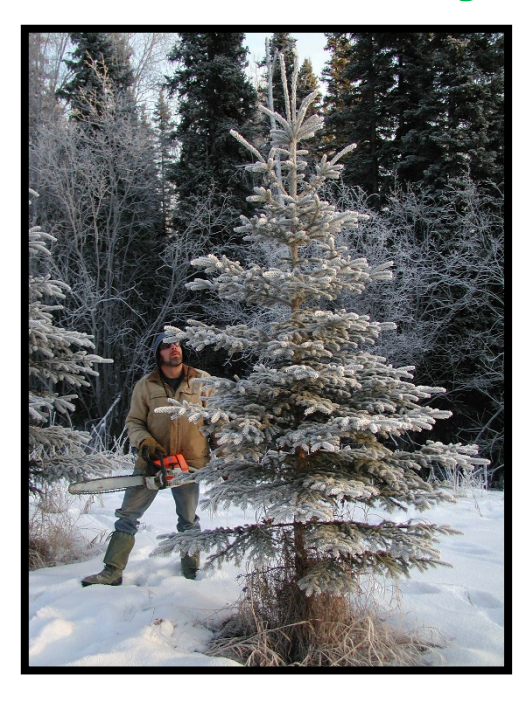
Merry Christmas from

Department of Natural Resources Division of Forestry Fairbanks-Delta Area 907-451-2600